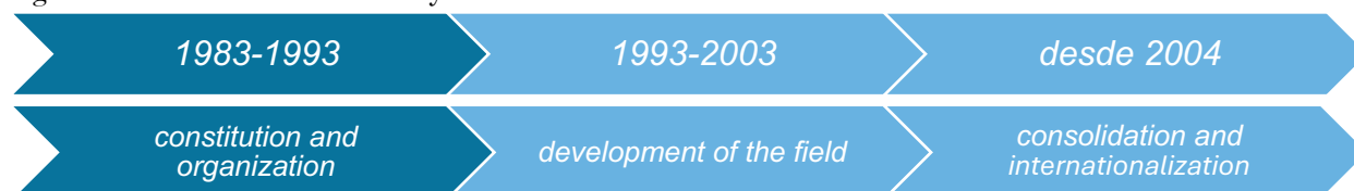
Figure 2 – Periods of SBEC's history

A Dossier commemorating the 40th anniversary seemed to us to be the appropriate format, thus collecting impressions about the Society for Comparative Education from the temporal dimension, as an invitation to reflect on the four decades of a Brazilian association of researchers from two perspectives that would allow us to capture: the gaze towards the Brazilian interior of comparative research in a first movement; and to capture the gaze from the outside in, from the outside in a second movement.