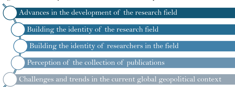
Figure 3 – Thematic pillars of the SBEC 40th Anniversary Dossier

We obtained an immense wealth of stories and personal and professional trajectories that retraced four decades in the history of comparative education worldwide, Ibero-American education and our own Brazilian education, where there are divides and substantial comparative reflections and analyses from a historical perspective.