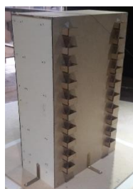
Image 2. Small-scale model plan

Image 3 shows the wind pressure coefficients for the building with no balconies, 0° wind direction. The C_p s of windward facades were predominantly positive, while in leeward facades the C_p s were negative. Also, the absence of balconies resulted in higher C_p values for windward