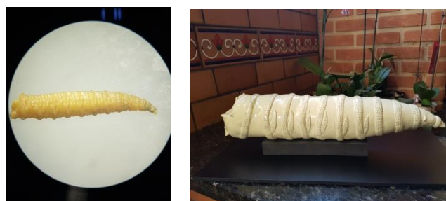
Figure 2. Specimen of third instar larva (right) and 3D model (left) on an approximately 48x larger scale of Chrysomya megacephala .